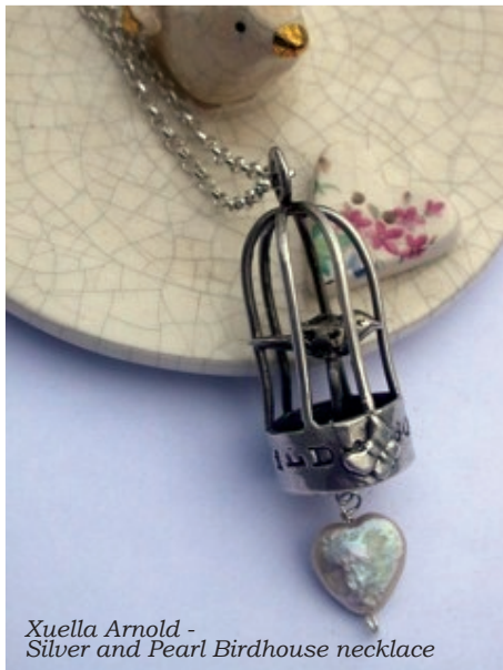
Xuella Arnold - Silver and Pearl Birdhouse necklace