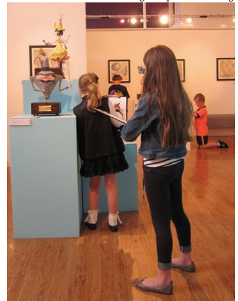
Young People sketching