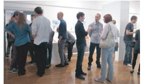
The Fateful Fable of 13: Preview

Free Exhibition Tours: You will remember from our last newsletter we've introduced monthly tours. When an artist or our Gallery Officer will give you special insight into the current exhibition.